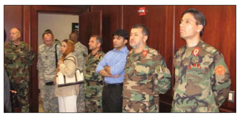
The visitors soak in more information during a tour of the Fort Jackson MEPS.