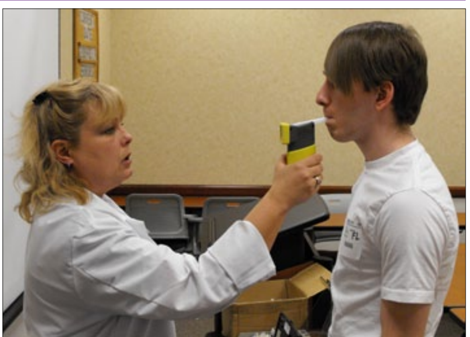
A MEPS employee administers the drug and alcohol test.