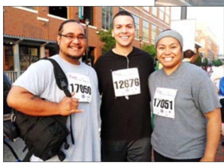
(Right) More than 17,000 people participated in Atlanta's Race for the Cure.