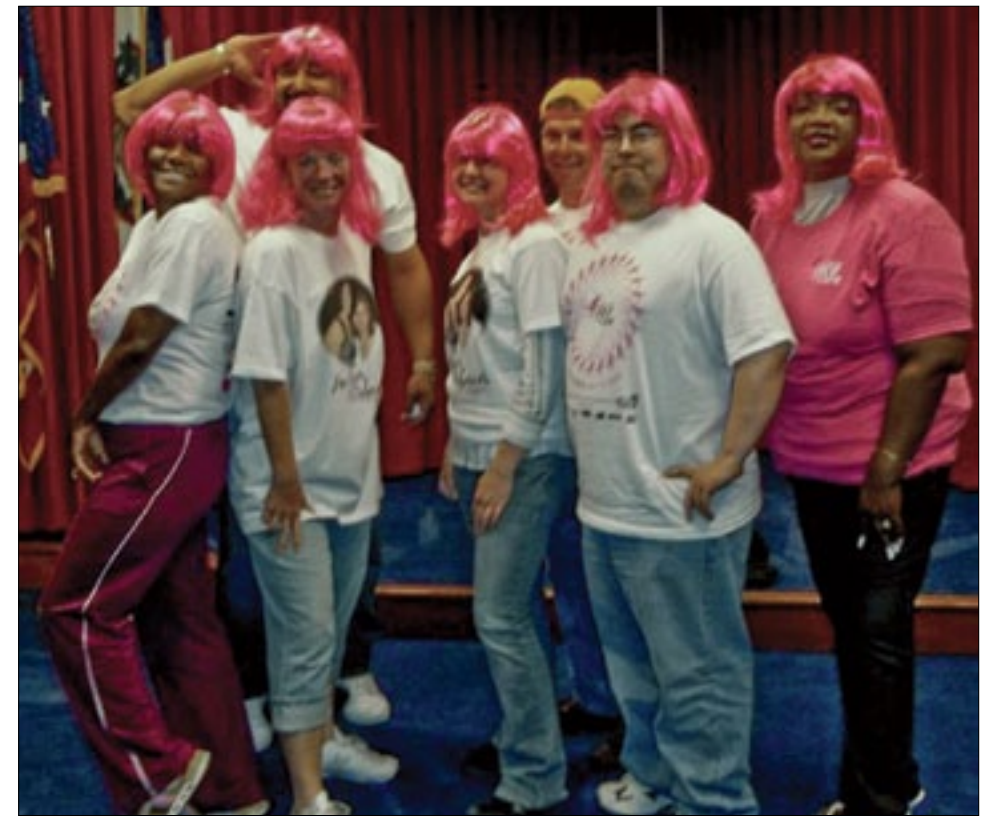
The Columbus MEPS Race for the Cure team shows its colors before hitting the road.

She became a public figure for her outreach and often attended Komen Columbus events and the Race for the Cure, including serving