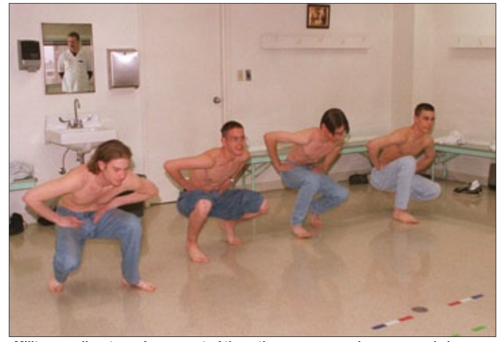
Military applicants perform a part of the ortho-neuro screening, commonly known as the 'duck walk.'

The ortho-neuro screening has been part of military processing since the early 1900s. "We're looking at doing more provocative testing for range of motion – strength, balance – and we're going to test people using protocols that are more applicable to the actual military jobs they will be performing," Col. (Dr.) Robert Ruiz, deputy command surgeon, said. "So it will be more occupationally based."