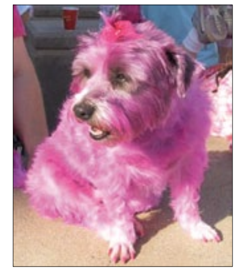
Even the dogs were "in the pink" at the Race for the Cure.

That same passion, carried on throughout the years by thou-